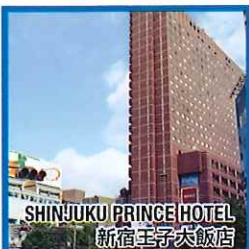
SHINJUKU PRINCE HOTEL 新宿王子大飯店