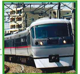
Hon-Kawagoe Station 本川越站

All seats on the Koedo Red Arrow Limited Express are designated seats. More comfortable reclining seats!