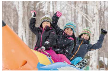
Family Snow Land