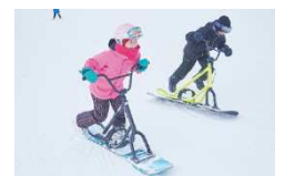
Yakebitaiyama Family Snow Park