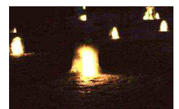
Candle Night Kamakura Festival