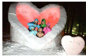
Furano Kan Kan Mura Snow Night Fantasy