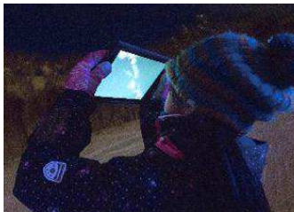
Furano Star Gazing Tour

Period Available Sat, Dec 23, 2017 (nat'l holiday) – Sun, Mar 11, 2018 (tent.)