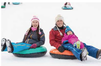
Shizukuishi Snow Land Tubing Park

Period Available Mon, Jan 1 (New Year's Day) – Wed, Jan 3, 2018, every Sun between Jan 7 and Mar 4, 2018, Mon, Jan 8, 2018 (nat'l holiday)