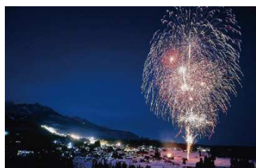
2018 Dynamite Carnival in Suginosawa

Period Available Sat, Dec 23, 2017 (nat'l holiday) – Sun, Apr 1, 2018