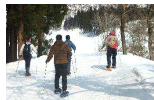
Snowshoes Experience Tour

Period Available Every Sat, Sun and holidays between Jan 13 and Mar 18, 2018