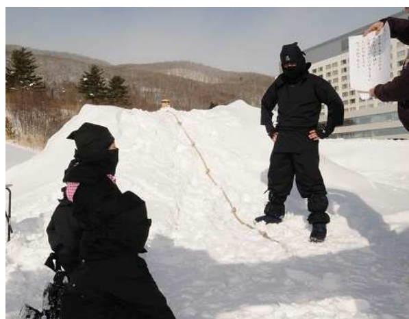
Snow Ninja Dojo at the Shizukuishi Ski Resort