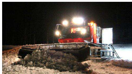
Night Cruise Tour

Period Available Rocket fireworks event days during the period between Sat, Dec 23, 2017 (nat'l holiday) and Sat, Mar 31, 2018