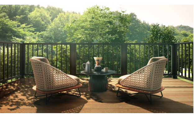
Conceptual image of terrace