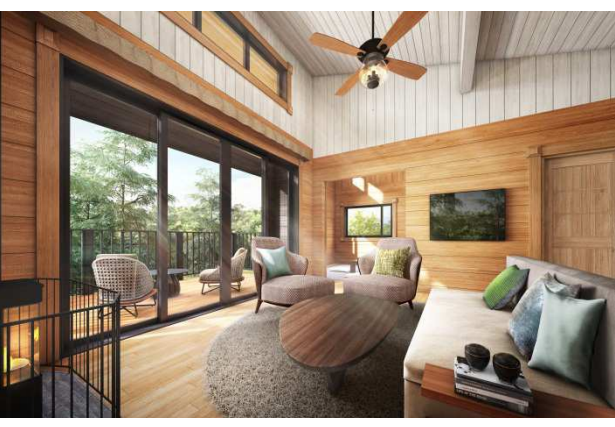
Conceptual image of living room