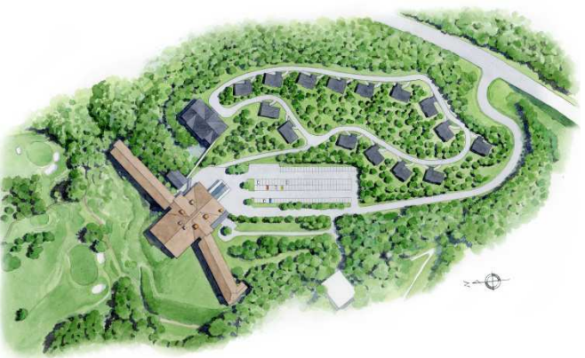
Conceptual Illustration of Bird's-eye View