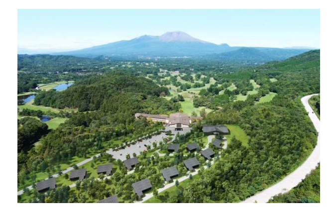
Karuizawa Asama Prince Hotel Prince Vacation Club Villa Karuizawa Asama Prince Vacation Club Karuizawa Asama Conceptual image

Seibu Holdings is placing efforts into the creation of new business areas as a priority challenge with the aim of strong, sustained growth. By combining the know-how cultivated in our existing businesses and our services in existing leisure property such as golf courses and ski resorts and bringing them to the highly exclusive resorts it owns around Japan, we will strive to expand our customer base and increase profit opportunities, to further increase our corporate value. Details may be found on the attachment.