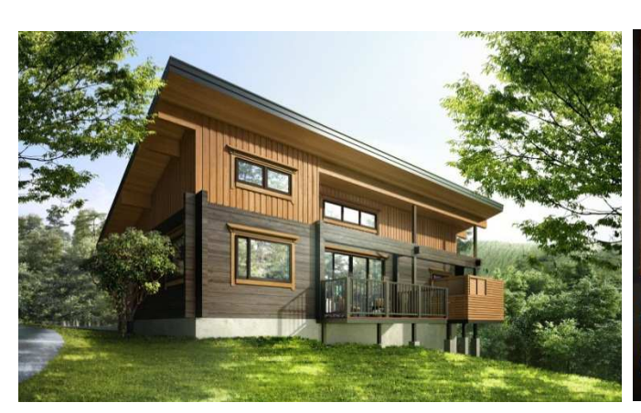
Conceptual image of exterior