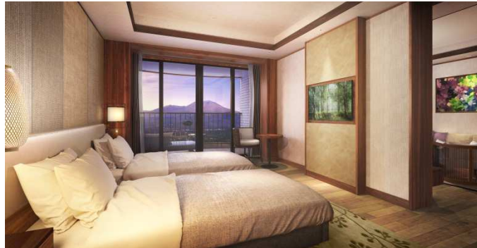
Conceptual image of Family Room living room