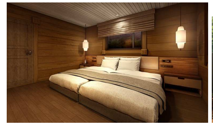
Conceptual image of bedroom