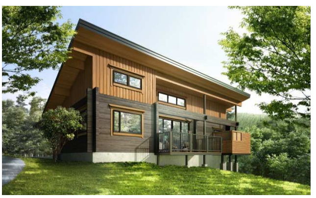
Prince Vacation Club Villa Karuizawa Asama Conceptual image of exterior