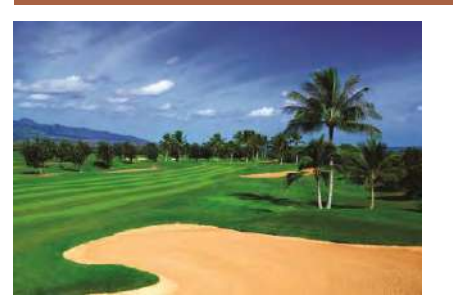
Hawaii Prince Golf Club