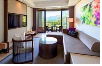
Prince Vacation Club Karuizawa Asama