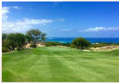
Hapuna Golf Course