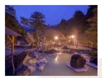
Manza Kogen Hotel Sekitei Rotenburo

**Karuizawa Prince Hotel Forest Hot Springs is for only staying guests at Karuizawa Prince Hotel East (main buildin The Prince Villa Karuizawa, The Prince Karuizawa. *MOMIJI HOT-SPRING is for only staying guests at Karuizawa Prince Hotel West (main building), The Prince Villa Karuizawa, The Prince Karuizawa. **Tachiyori no Yu Karuizawa Sengataki Onsen is a specialized Onsen facility without guest rooms. *Breeze in Plateau is only for staying guests at Prince Vacation Club Villa Karuizawa Asama, Prince Vacation Club Karuizawa Asama, Karuizawa Asama Prince Hotel and golf players at Karuizawa Asama Golf Course.