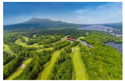
Hokkaido Country Club