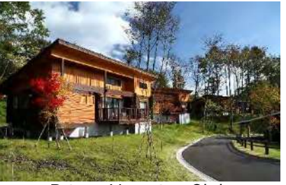
Prince Vacation Club Villa Karuizawa Asama