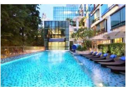
Park Regis Singapore