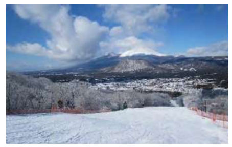
Karuizawa Prince Hotel Ski Resort