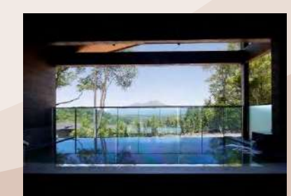
Karuizawa Asama Prince Hotel Rotenburo