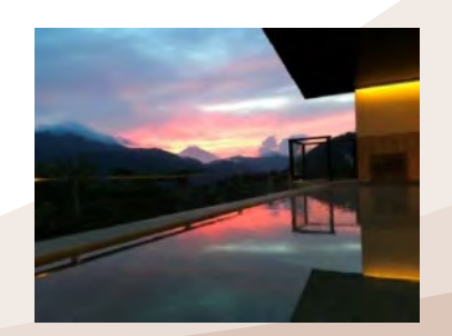
Ryuguden Hot Spring open air bath