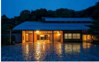
Prince Vacation Club Sanyo-so