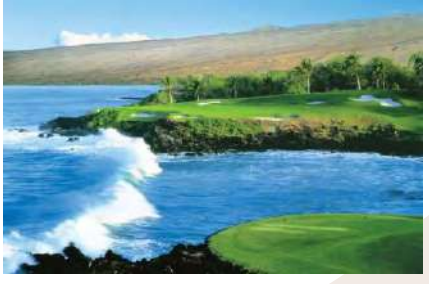
Mauna Kea Golf Course