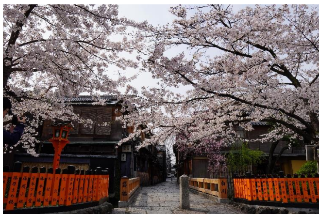
Gion Shirakawa, a 20-minute walk from the hotel

Make your spring travel to Kyoto truly unforgettable with a stay at The Hotel Seiryu Kyoto Kiyomizu. Immerse yourself in the beauty of cherry blossoms and create cherished memories that will last a lifetime.