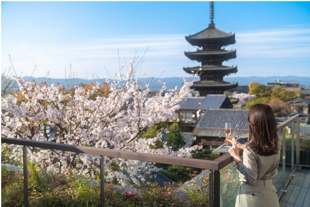
View from The Hotel Seiryu Kyoto Kiyomizu

Kyoto, renowned for its rich historical heritage and scenic beauty, is an essential destination to experience during the cherry blossom season. The allure of cherry blossoms in Kyoto is a celebration of spring and a cultural phenomenon deeply embedded in the Japanese psyche.