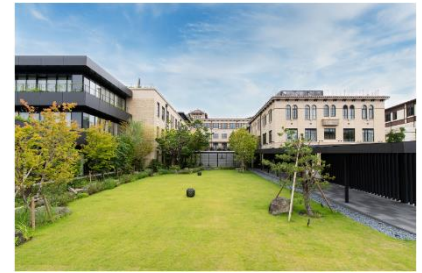
Heritage hotel converted from historical building