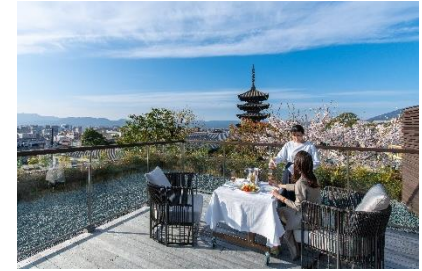
Guest room (Terrace Twin)