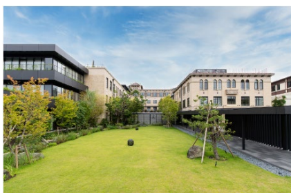
Heritage hotel converted from historical building